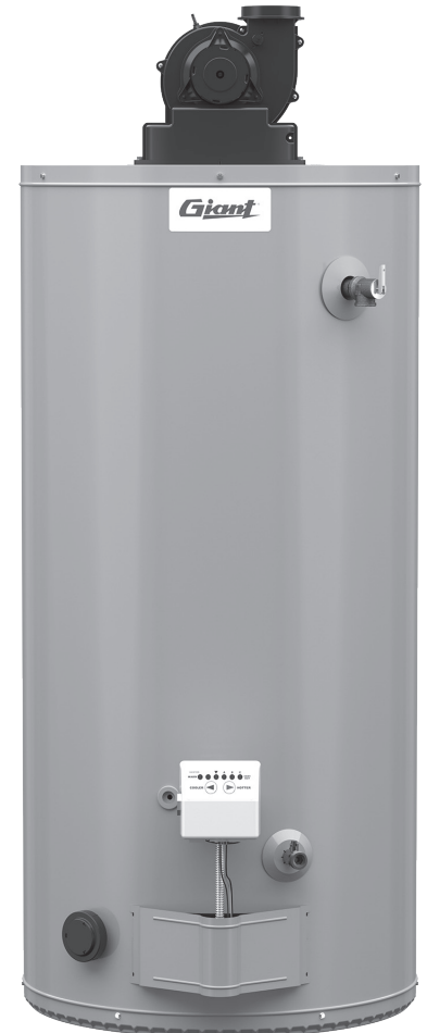
Illustrated model: UG40-40SPV3-P2 201