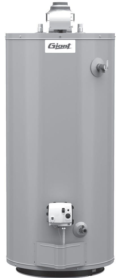
Illustrated model: UG40-40SD3-N2 100