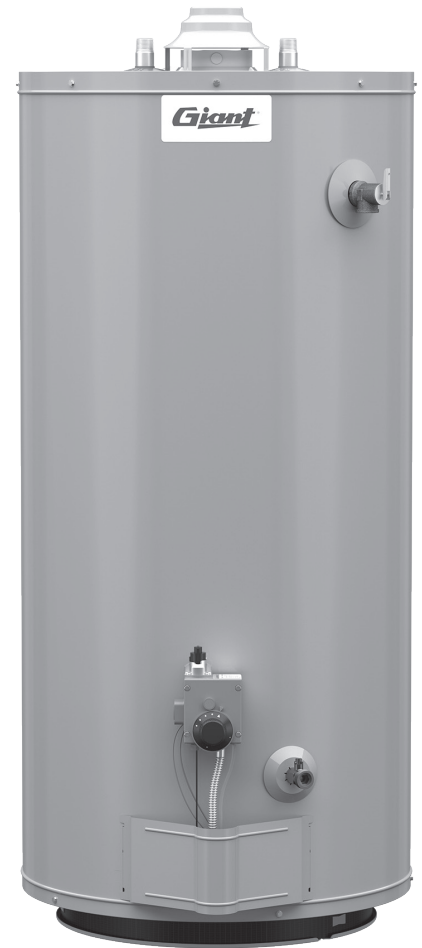
Illustrated model: UG40-40S3-N2 250