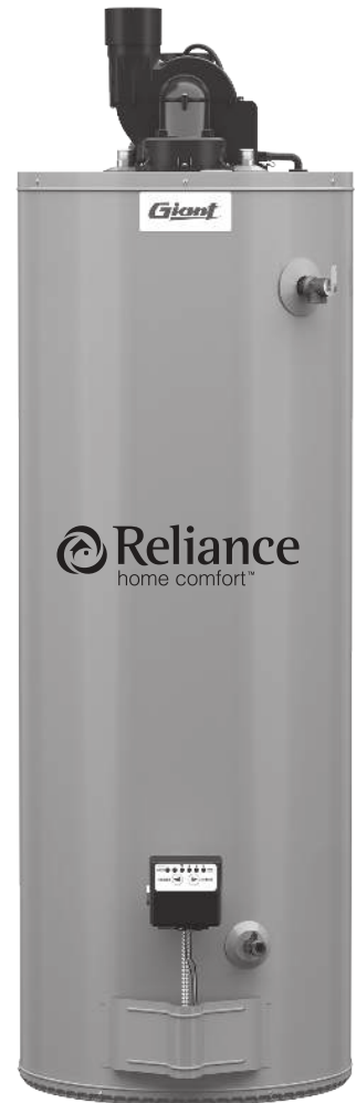
Illustrated model: UG50-45TPDV3-N2-RE 300