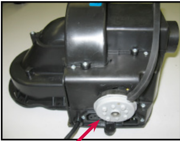
Intake vacuum switch